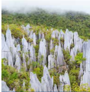
Gunung Mulu National Park

Mount Kinabalu is one of the highest mountains in East Malaysian State of Sabah and situated in Kinabalu National Park. It permits you to climb summit of the mountain by passing through the hurdles. The tour starts at the time of sunrising and climbers generally reaches the headquarters by mid-afternoon. Low peak can be climbed quite easily by the physically fit climber without any climbing equipment. Mount climb activities include rock climbing, paragliding & mountaineering that requires proper training and equipment for climbing.