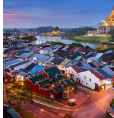
Sarawak City Tour

Sabah City Tour gives a very enjoyable experience to the visitors while visiting the fascinating attractions of the city. Apart from this, the city is renowned for many adventurous activities, nature based attractions, Parks, Wild life Reserves, shopping & dining experience to fill you with lots of wonders. The city has plenty of opportunities that suits the tastes and preferences of the visitors. The tour takes you to explore many facets, feel nature and know about city's culture.