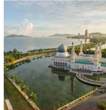
Kota Kinabalu City Tour

Penang Island is famous for sandy beaches, rich culture and natural scenery. Also known as "Pearl of the Orient" that consists resorts of international standards that sprouted up full facilities for rest and recreation. The tour highlights private mansion, famous museums, stunning temples, Monkey beach & turtle sanctuary. It takes you to learn all about the most popular activities with plenty of sightseeing opportunities that includes war museum, snake temple, botanical garden & butterfly farm.