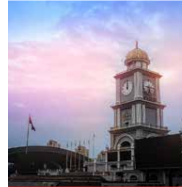
Johor Bahru City Tour

Sarawak is a large state that attracts visitors to come and explore the adventure in Malaysia. Sarawak is the most dynamic and sophisticated city where people of different races, culture and regions are found. The tour takes you to the spectacular caves and extraordinary rocks of the city to feel the warmth of friendliness. The fantastic place that gives visitors to explore the myriad areas including nature reserve, cultural village, heritage area, Sarawak museum & orchid garden.