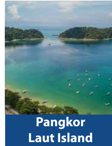
Pangkor Laut Island

Manukan Island is one of the largest Islands, situated amongst tropical greenery that offers unparalleled water sports activities, hotel accommodation & delicious cuisines at one of the pristine corner of the world. A wonderful destination that takes you to experience the natural surroundings of the Island. It also features an outdoor pool, restaurants and villas for offering wide range of activities such as diving, snorkelling and trekking. Glass boats help visitors to view marine life near sandy beaches which is surrounded by crystal clear water - a perfect place for swimming.