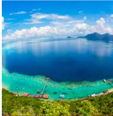
Sabah City Tour

Kl Hop on and Hop off Bus Tour is a free, easy and excellent way to visit the wonderful attractions of the city in a semi glass double decker bus which covers more than 70 attractions in a unique way. The bus is equipped with multi language taped audio commentary, covering all the Inner attractions and places. The tour takes you to see lakes, gardens, historical quarters, towers & much more. A guide will be there for you to explain about all the attractions to make it your most convenient tour.