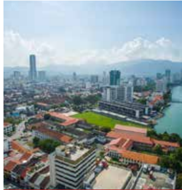
Penang City Tour

A green area stands high above the sea level is the smallest district in Penang that positioned close to the border to the north. Cameron Highlands is Malaysia's prime vegetable producer & agricultural heartland, supplies fresh vegetables to the major cities of the country. The tour takes you to the remarkable Rose garden, cactus valley, bee farm, strawberry farms & tea estate in the amazing and unique corner of Malaysia.