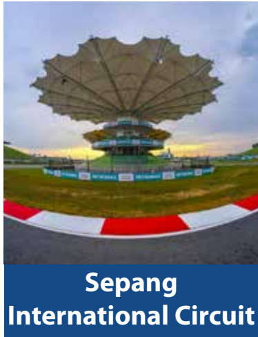
Sepang International Circuit

A motorsport race track located near Kuala Lumpur international Airport is the venue used for the events including Formula One, Malaysian Grand Prix, A1 Grand Prix, Malaysian Motorcycle Grand Prix and more. The amenities includes a souvenir shop, a restaurant, an automotive museum, a motor sports club and a medical centre. The sports track is reliable, hot and humid that provides lot of fun and entertainment to the spectators and the riders who are engaged in such activities.