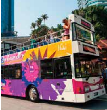
Kl Hop On Hop Off City Tour

Kl Hop on and Hop off Bus Tour is a free, easy and excellent way to visit the wonderful attractions of the city in a semi glass double decker bus which covers more than 70 attractions in a unique way. The bus is equipped with multi language taped audio commentary, covering all the Inner attractions and places. The tour takes you to see lakes, gardens, historical quarters, towers & much more. A guide will be there for you to explain about all the attractions to make it your most convenient tour.