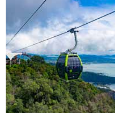
Langkawi Cable Car

Legoland is an international theme park of Malaysia with more than 40 interactive rides, shows, attractions that offers full day entertainment and adventure. The park also includes resort for the accommodation and dining facilities. The place gives you a chance to experience the diversity at single place. Here a wide variety of many indoor and outdoor activities, water based rides & splashes gives special enjoyment to young ones as well as kids.