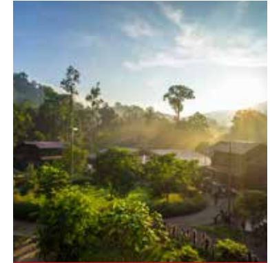
Taman Negara Full Day Tour

Johor Bahru has become a major tourist destination with two major amusement Parks, mosque and a glass decorated Hindu temple. A must visiting place in the city that allows visitors to know about the Religions in Malaysia. The tour takes you to explore the major attractions of the city where you will find the royal family crowns, antique handicrafts, artefacts & unique buildings of state government secretariats with impressive architecture and designs. Handicraft centre lies opportunity for you to view natural fabric, Batik Painting, traditional art and craft in Malaysia.