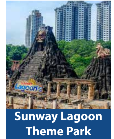
Sunway Lagoon Theme Park

Pangkor Laut Island is a private Island nestled amidst an ancient rainforest and white sandy beaches, set along the straits of Malacca. It has been developed as the privately luxury resort which also provides spa facilities to the travellers. The Island not only boasts to worlds' premier resorts but also variety of wildlife. The Island is easily accessed by a short boat ride or helicopter transfers where visitors can engage in the water sport activities like jet skiing & snorkeling.