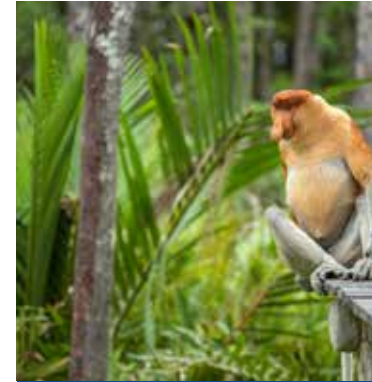
Kinabalu National Park

A'Famosa is the most notable attraction of the fort which consists a hotel, indoor and outdoor theme park & golf course. It's one of the oldest architectures and an Ideal place in South East Asia which provides fun at the golf course, swimming pool and tennis courts. Several theme parks include Animal World Safari, Cowboy Town, water world & wonderland where you can enjoy different activities like Archery, Horse Riding, Paintball, Rock Climbing, Go Kart, Cycling, Paddle Boat, Pony Riding, Horse Carriage, Target Shooting & Fishing.