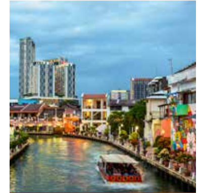
Malacca City Tour

Kota Kinabalu is one of the fastest growing cities in Malaysia with many tourists' attractions in and around the city. This place is the bustling gateway of Sabah and Borneo Island with thrilling jungle trekking & camping at the National Park. An exotic tourists' spot with beautiful Islands and clean sandy beaches that consists breath-taking sunset view, blossoming arts, wildlife, outdoor activities and diving adventures. The tour takes you to the Cultural village, Sabah Museum, Museum of Islamic civilization, city mosque & wetland culture.