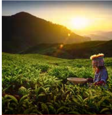
Cameron Highland City Tour

Langkawi Island is one of the best place to experience the Island's rich history, sights & the most legendary landmarks where you will get to know the beauty of the wonderful rural countryside. This tour takes you to white sandy beaches to leisure, fun and splashing around the blue waters. The perfect location with plenty of activities that provides fun and enjoyment to the nature lovers as well as adventure lovers.