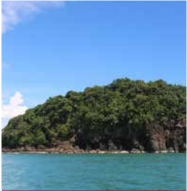
Langkawi Half Day Island Tour

Langkawi Island is one of the best place to experience the Island's rich history, sights & the most legendary landmarks where you will get to know the beauty of the wonderful rural countryside. This tour takes you to white sandy beaches to leisure, fun and splashing around the blue waters. The perfect location with plenty of activities that provides fun and enjoyment to the nature lovers as well as adventure lovers.